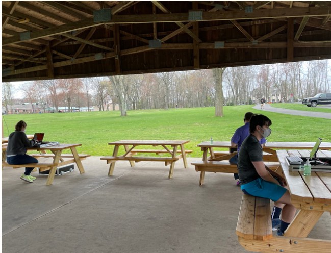
Community Members using mobile computer lab sponsored by The Philadelphia Foundation

Aston Township Lioness Club CHILMARKeting Giant Markets Bags 4 My Cause Program