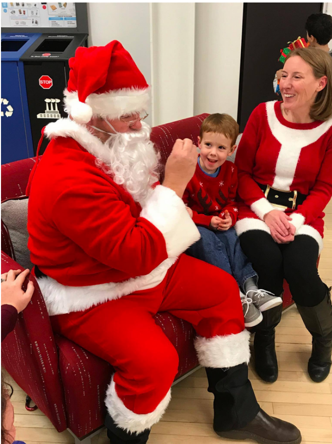
Signing Santa talking with Deaf children about their wishes for the upcoming year at DHCC's Holiday Party 2019 at Swarthmore College