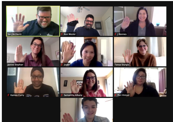
Staff members waving during Zoom meeting

The Foundation for Delaware County The Philadelphia Foundation The McLean Contributionship HealthSpark Foundation Maguire Foundation The Independence Foundation Lambert Family Foundation HealthSpark Foundation The Montgomery County Foundation Inc The Philadelphia Foundation Tompkins Charitable Gift Fund Anna B. Glauser Trust